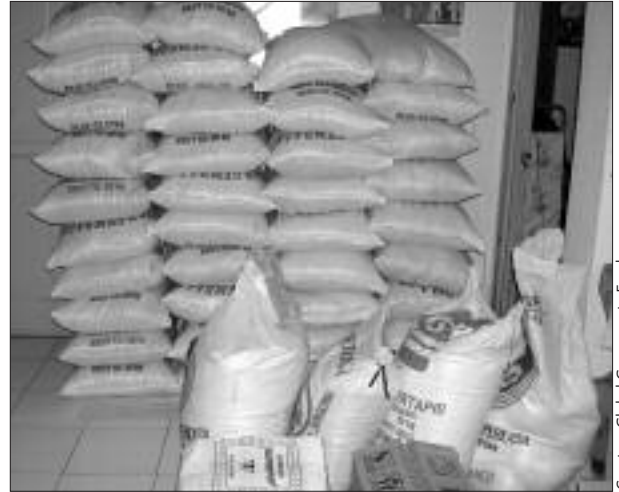
Rice and sugar for refugees

There are also many accounts of temporary housing being thrown up without any consultation with affected peoples about design, location, needs (such as sanitation, space to conduct small enterprise, school and community buildings, etc.). Similarly, while many fisher folk have benefited from boat repair and the provision of new boats,