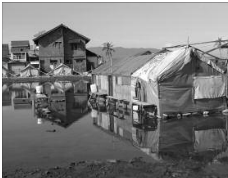
General tsunami damage, Aceh, Indonesia

Lastly, the enormity of the international response was in some ways a double-edged sword. On the one hand it meant that significant resources could be brought to bear on the crisis. On the other, it brought about enormous competition for resources between governments and non-governmental organizations (NGOs), and between and among the many different NGO's that arrived to help and those already on the ground. Also, the arrival of many highly paid foreign staff drove up prices in many places, especially in the housing market.