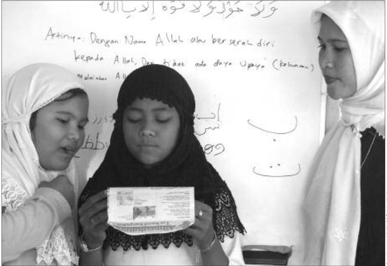
Children studying at a Meushollah (prayer room) and school run by Aceh Judicial Monitoring Institute