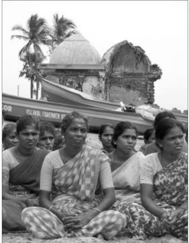
Women at a community meeting organized by ROSE in Tamil Nadu, India

In Trincomalee, in each camp 4-5 groups with 7 members [each] have been formed. Now there are 17 active women's groups in welfare camps of Trincomalee... Many [women] have now come forward to get assistance for self-employed income generating projects, either as a group or individually. They are now geared to pressurize the camp management to heed their problems and take measures to solve them. When any form of violence takes place the women show their protest, whether inside their camps or outside.