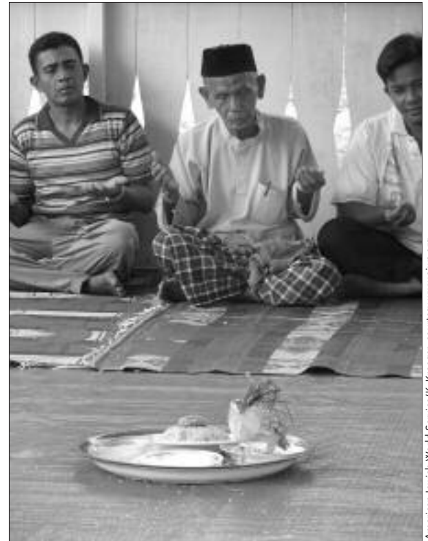
Village elders dedicating a children’s play space in one of the baraks (camps), run by Church World Service, Aceh, Indonesia

While international organizations were genuinely committed to reaching all survivors of the disaster, the urgency of the situation created a reasonable tendency for relief agencies to go through ‘official’ or mainstream community leaders. The observed organizations noted that, while it is important to work through official structures and community level organizations, they do not necessarily represent the interests of all population groups in a community or region. The needs and priorities of marginalized groups such as dalits in India, sex workers in Thailand or widows in Sri Lanka are not typically