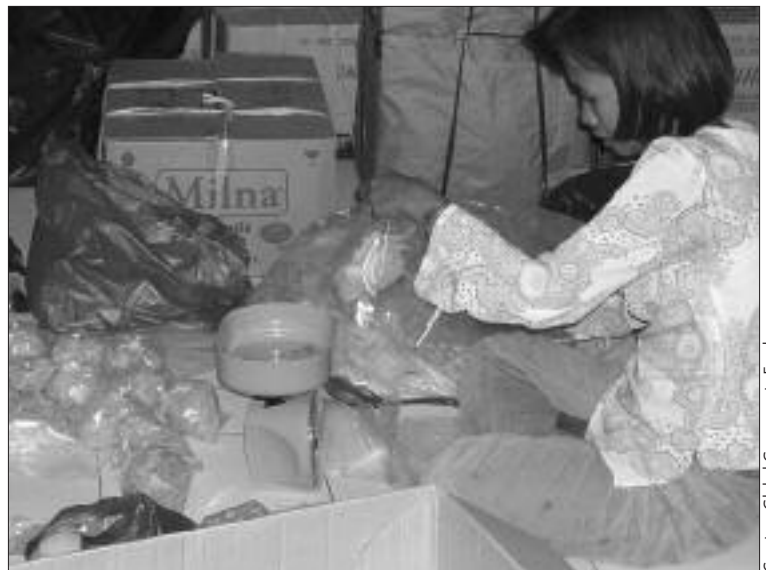
Preparing aid for refugees

there are many cases where boats provided were not based on traditional designs and therefore were not considered seaworthy. The observed organizations sought to counter this trend by providing funding for local groups to advocate on their own behalf and demand that their rights be respected, and where violations did occur, to document them in the hopes of future redress.