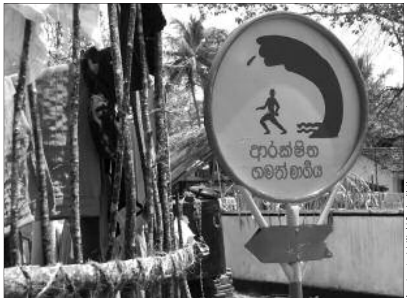
Tsunami warning signs near Galle, Sri Lanka

Local organizations provided with timely funding, even in small amounts, played an essential role in meeting the immediate needs of survivors and helping to get local communities on a track towards recovery, all the while addressing fundamental issues as dignity, rights and agency.