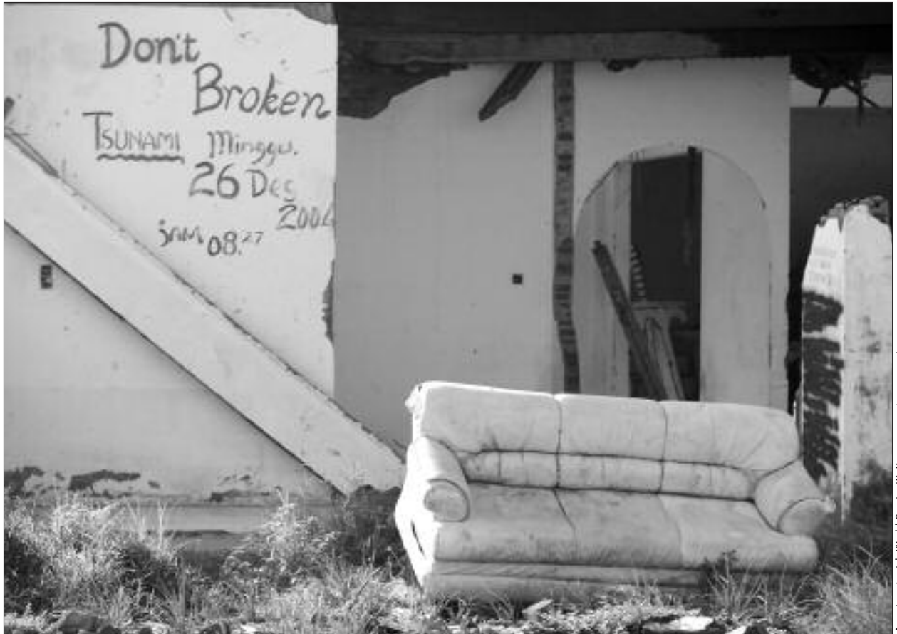
General tsunami damage, Aceh, Indonesia