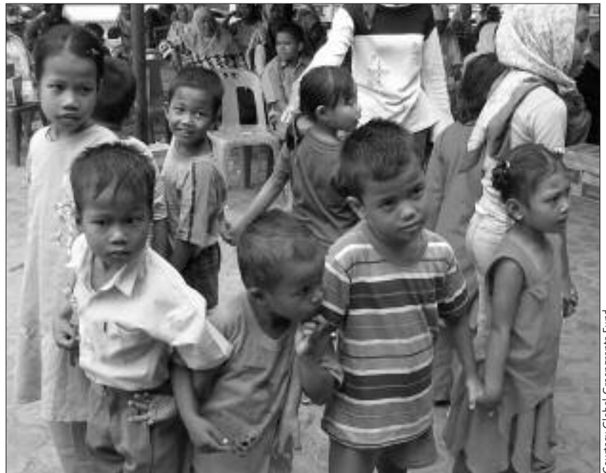
Activity with children in Belawan

Global Greengrants Fund , another public foundation that does not traditionally fund relief activities, intervened to "...ease suffering, protect the rights of coastal communities and ensure sustainable reconstruction." In the early days of the crisis, Global Greengrants Fund channeled $70,000 to local groups for immediate relief. Through spring 2006, Global Greengrants Fund had made 23 grants totaling $208,250: $18,250 to 3 grantees in India, $163,000 to 18 grantees in Indonesia, and $27,000 to 2 grantees in Sri Lanka. In addition to providing