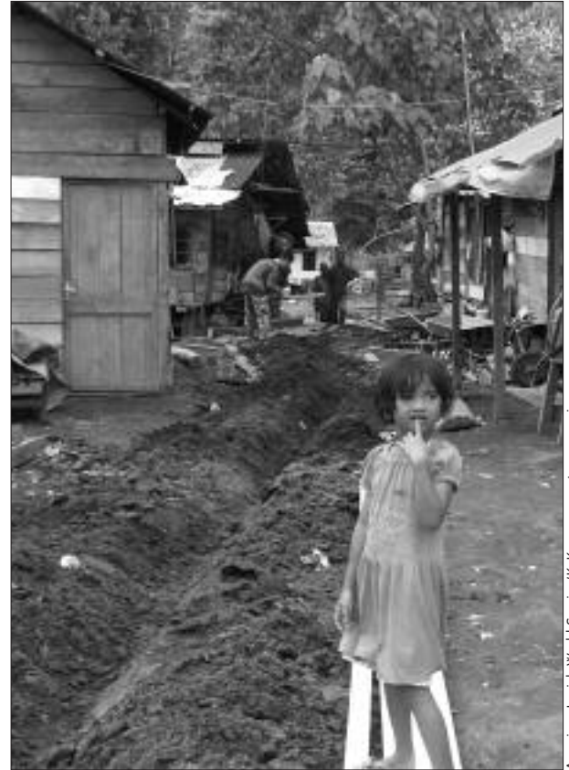
Relief camp pipeline at a site overseen by Church World Service, Aceh, Indonesia

Overall, Acehnese NGOs were mostly excluded from response coordination. The observed organizations however, some of which had been supporting Acehnese human rights organizations prior to the tsunami, were sensitive to the full range of issues connected to supporting civil society and focused their grantmaking on grassroots organizations that had a track record of working for human rights, women’s rights, environmental justice and peace.