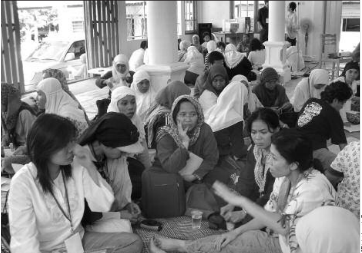
Women activists discuss post-tsunami challenges, Aceh